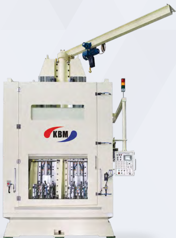
Auto Vertical Type